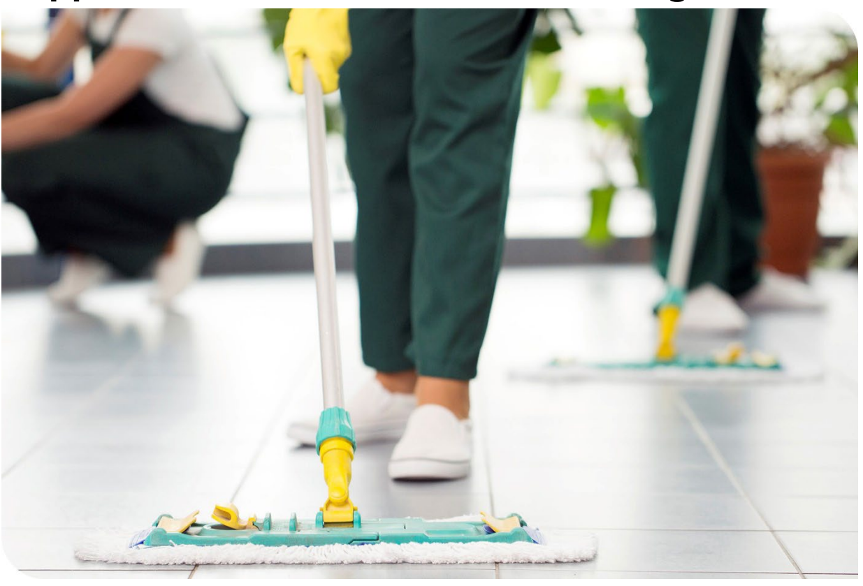
Version 3.3 • 14 November 2022 – 01 December 2027